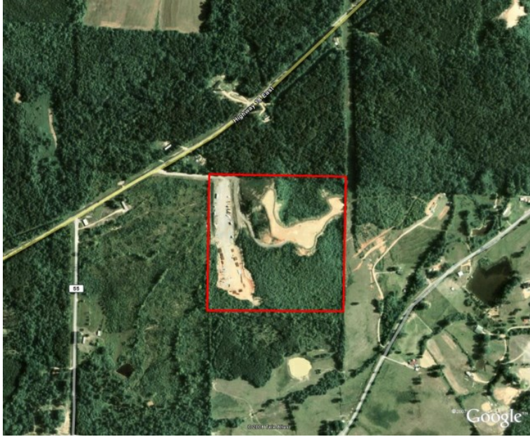
Highway 18 East, Berry, Fayette, AL, 35546